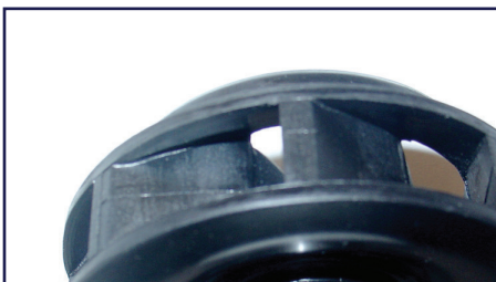
Our premium impeller is made from glass reinforced PPS