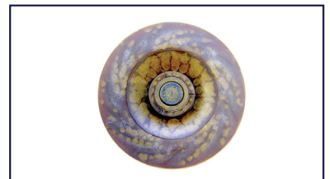
Flaking and disintegration can occur on previous impeller designs