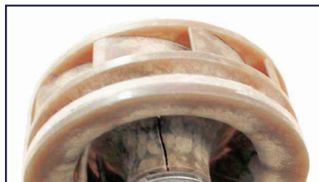
Cracking and deterioration will occur on lesser-quality impellers